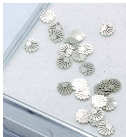
Figure 3: Silver logo labels (3 mm in diameter) for a pearl farm. These can be affixed onto the bead prior to insertion and later be used to trace a beaded cultured pearl back to its farm.

Any such logo marker must be extremely thin, be composed of noble metal (and therefore be resistant to corrosion) and have the same convex shape as the nucleus to ensure that the resulting cultured pearl is also round. However, the production of such round metal labels, generally 3–4 mm wide and 0.05 mm thick, is relatively expensive. Different label production techniques were tested, such as galvanic production, pressing, etching and cutting with a