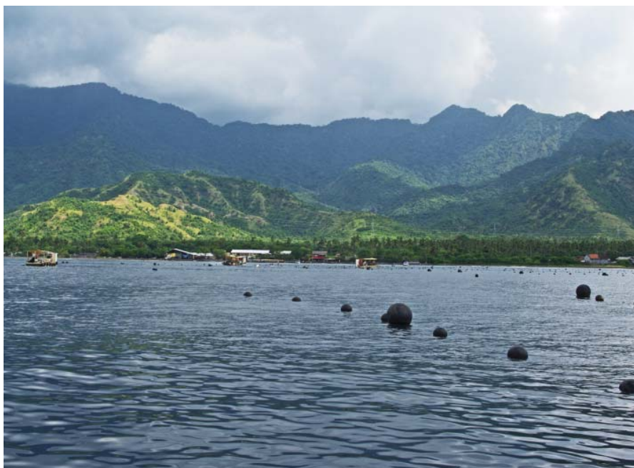
Figure 7: The Atlas Pearl farms that produced the necklace shown in Figure 1 are located in Bali (shown here) and West Papua, Indonesia. Giving consumers access to the origin of their cultured pearls may create additional value for pearl farmers.

Table 1 lists the results for the seven shell samples and three cultured pearls from different locations that were