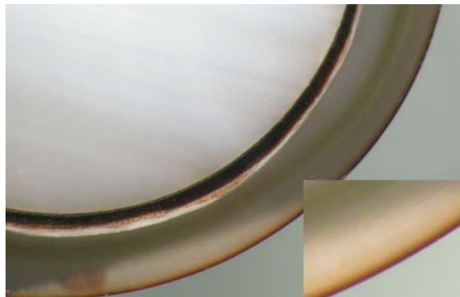
Figure 2: Cross-section of a 'chocolate' beaded cultured pearl. The light-coloured bead (i.e., nucleus) and the darker overgrowth are clearly visible. It is evident in the enlarged image at the bottom right that the brown colour has been artificially added. This demonstrates the porosity of a cultured pearl and its potential for absorbing chemically doped or colour-doped solutions. The colour has penetrated approximately 0.5 mm.

pearl (also called nacre) surface of pearls is made up of aragonite tablets. A pearl's porous structure means that it has a good potential for absorbing chemically doped or colour-doped solutions. A good example of this are dyed cultured pearls (e.g., Figure 2), which can be found in many different colours (Hänni, 2006; Strack, 2006). In a similar way, cultured pearls from selected producers could be marked using a colourless doped solution — that is unique to a pearl producer — after harvest. If chemically doped, these pearls could later be identified in a gemmological laboratory using EDXRF spectroscopy (Hänni, 1981). However, the applicability of this approach is limited given that EDXRF spectroscopy is not in widespread use in the jewellery industry.