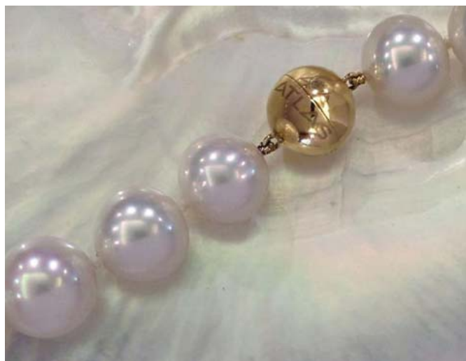
Figure 1: A branded necklace of South Sea cultured pearls (12 mm in diameter) produced by Atlas Pearls in northern Bali and West Papua (Indonesia).