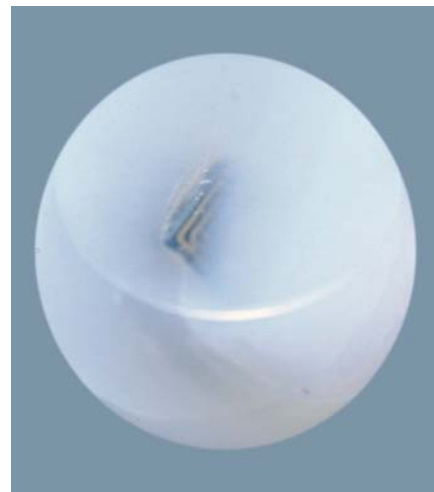
Figure 5: A composite shell bead that has been sliced and polished to show a small RFID chip (3 mm long) embedded within it. The information on such a chip can be accessed using an RFID reader.

RFID chips have been introduced into commonly used Mississippi shell nuclei, which are currently being piloted by pearl farmers in the Pacific Ocean.