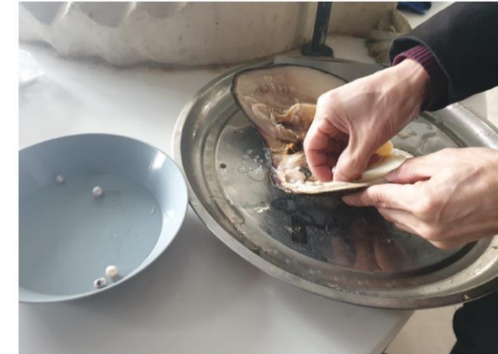
Mollusc has been cut open and pearls are removed

Mollusc Polished in sawdust-type substance